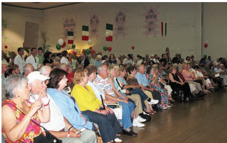
Crowd listening to The Don Giovannis

Next year the Festa will be held on October 16, 2011. Mark your calendar and plan to volunteer and support your club. We need everyone's help to make the next Festa a big success. Remember, Festa is our biggest annual fundraiser. If you have any suggestions to make Festa even better please contact the Chairman.