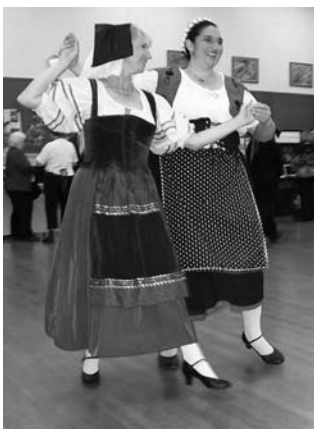
La Danza Balliamo Dancers of Sacramento Festa 2009

Advance admission tickets $5 and $8 at the door. Circle your calendar NOW and plan to celebrate Italianita .