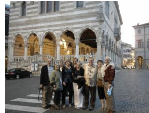
Small group tour discovers Udine

Or explore Piemonte from Milano to Torino: taste big red wines, truffles, bicerin & more. Bonus: relax lakeside in Stresa on lovely alpine Lago Maggiore (cht). Be a Slow Food Lover!